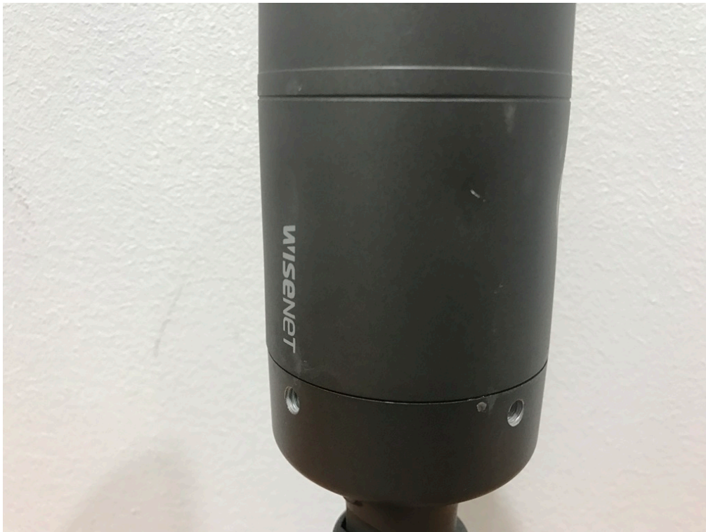
[Test result confirmation_ Enclosure 02]