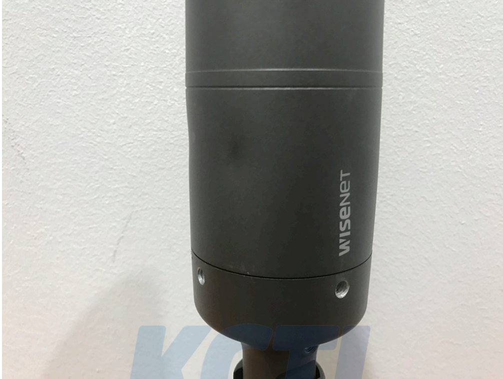
[Test result confirmation_ Enclosure 01]