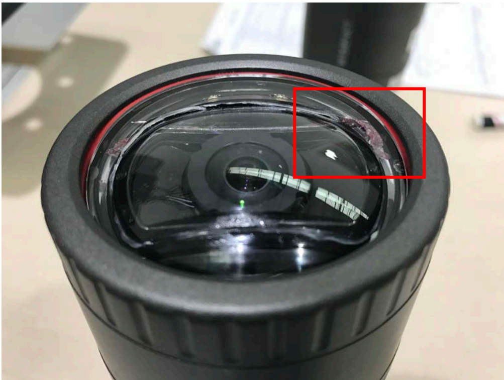
[Test result confirmation_Window 02]