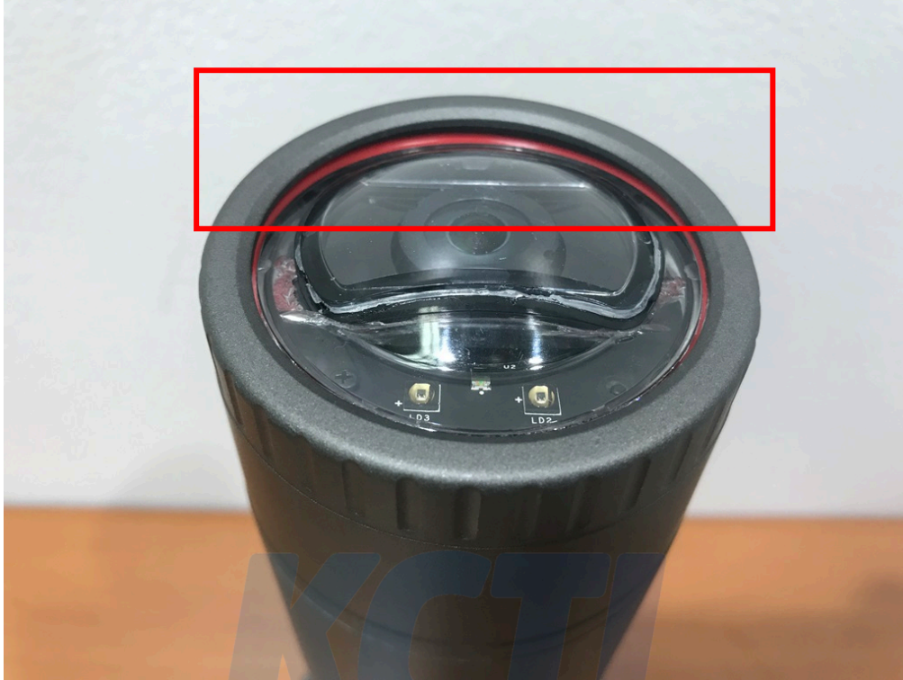
[Test result confirmation_Window 01]