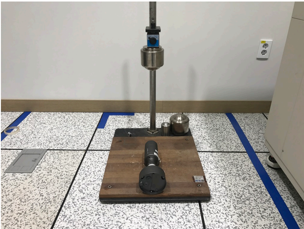
[During the test_Enclosure]