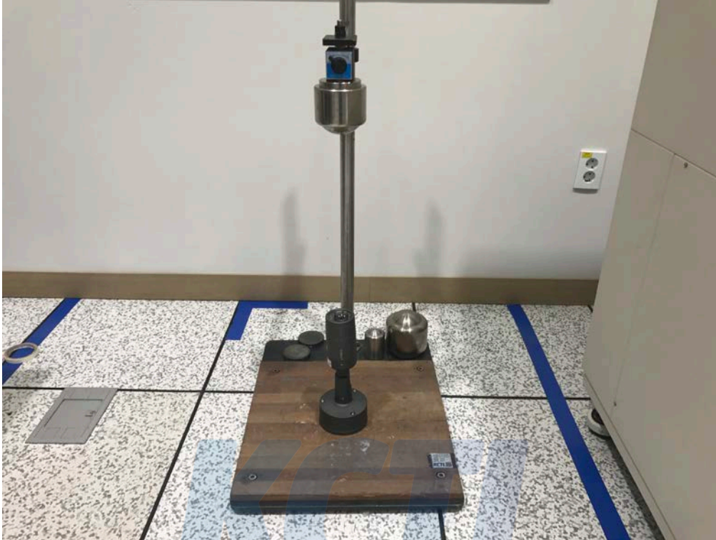
[During the test_Window]